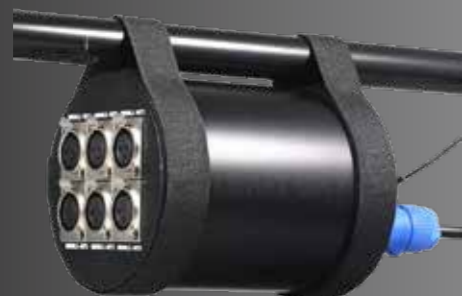
LIGHT SKY RDM 860 Truss mount RDM/DMX Splitter