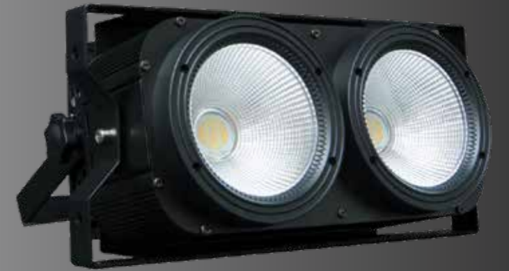
2 WAY BLINDER LED WARM WHITE 3.6 KG