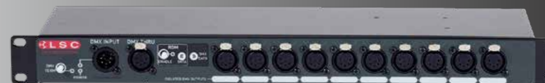
LSC MDR CONTROL SYSTEMS 2x4 way RDM/DMX Splitter