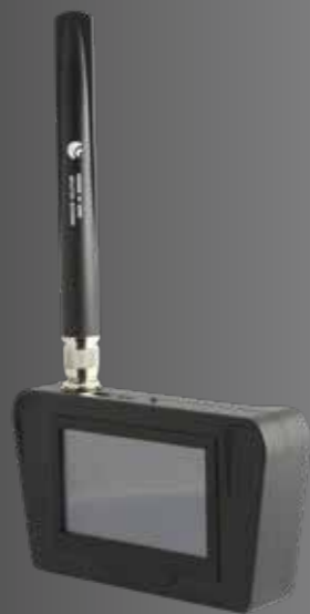
W-DMX G5 W-DMX™ transmitter and receiver tester