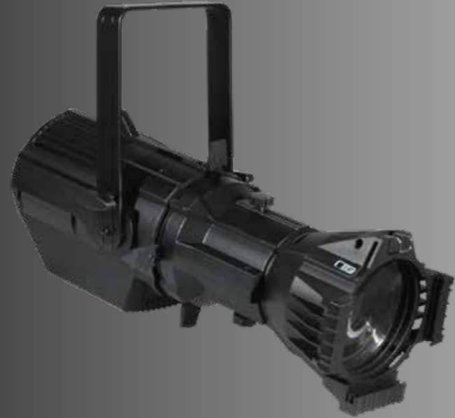
PROFILE SPOT 19° and 26° 9.4 KG