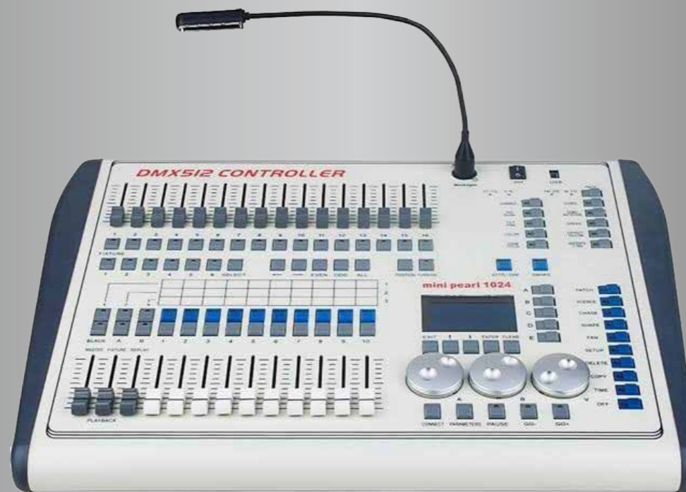
AVOLITES Mini Pearl 1024