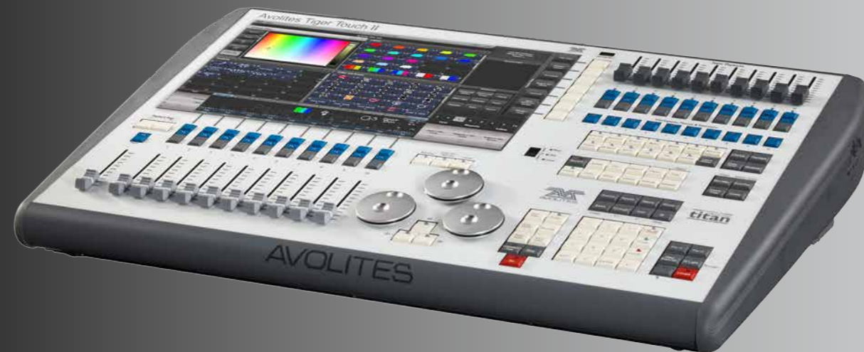
AVOLITES Tiger Touch II