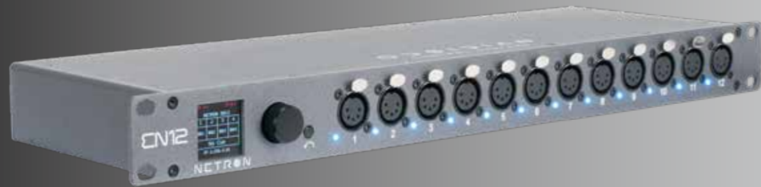
OBSIDIAN EN12 CONTROL SYSTEMS Ethernet to DMX/RDN gateway