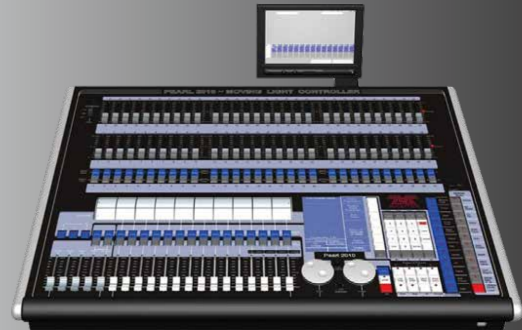
AVOLITES Pearl 2010