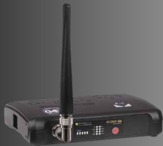
W-DMX G4 Dual Band W-DMX™ Transceiver