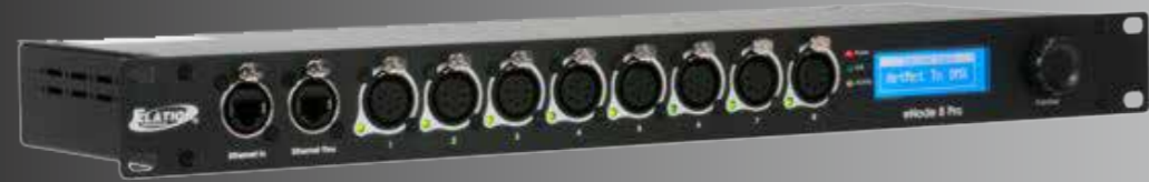
ELATION eNode8 Pro 8-universe Ethernet-DMX node