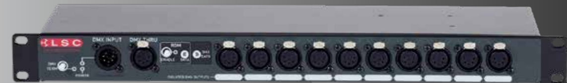
LSC MDR CONTROL SYSTEMS 2x4 way RDM/DMX Splitter