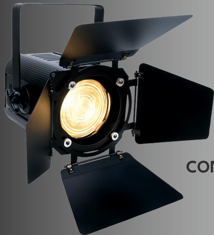
CONVENTIONAL FRESNEL 1KV 5.3 KG