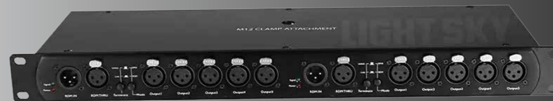
LIGHT SKY RDM 210 2x4 way RDM/DMX Splitter