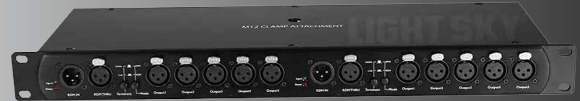
LIGHT SKY RDM 210 2x4 way RDM/DMX Splitter