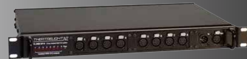
THEATRELIGHT NZ MDR 2x4 way RDM/DMX Splitter