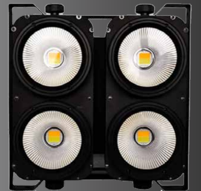
4 WAY BLINDER LED WARM WHITE 5.6 KG